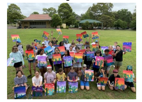
Stage 3 have enjoyed 3 days of fun activities as a substitute for camp this year. Students have engaged in team building exercises and creative arts activities.