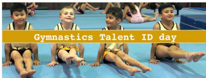
Gymnastics Talent ID day

Sydney Hills Gymnastics is the leading Men's Program Gymnastics club in NSW. In 2018 we were awarded MAG National Junior Club Champion MAG State Club Champion Club MAG Grand Prix Champion Club